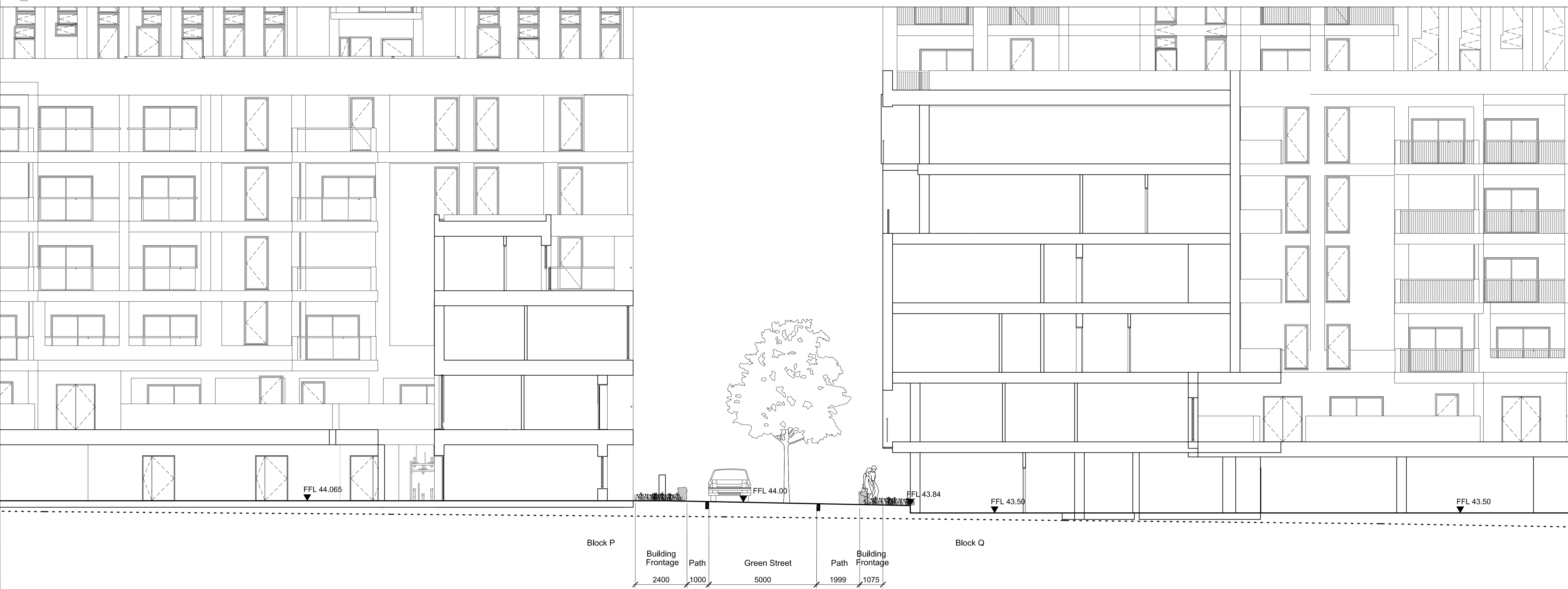
2 SECTION 14 SCALE 1:100