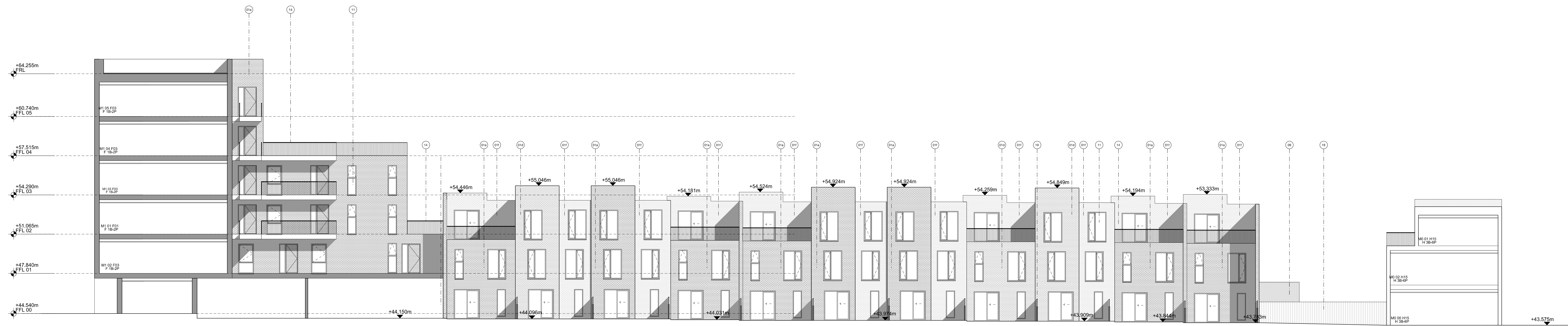
01 West Elevation 02 1:125