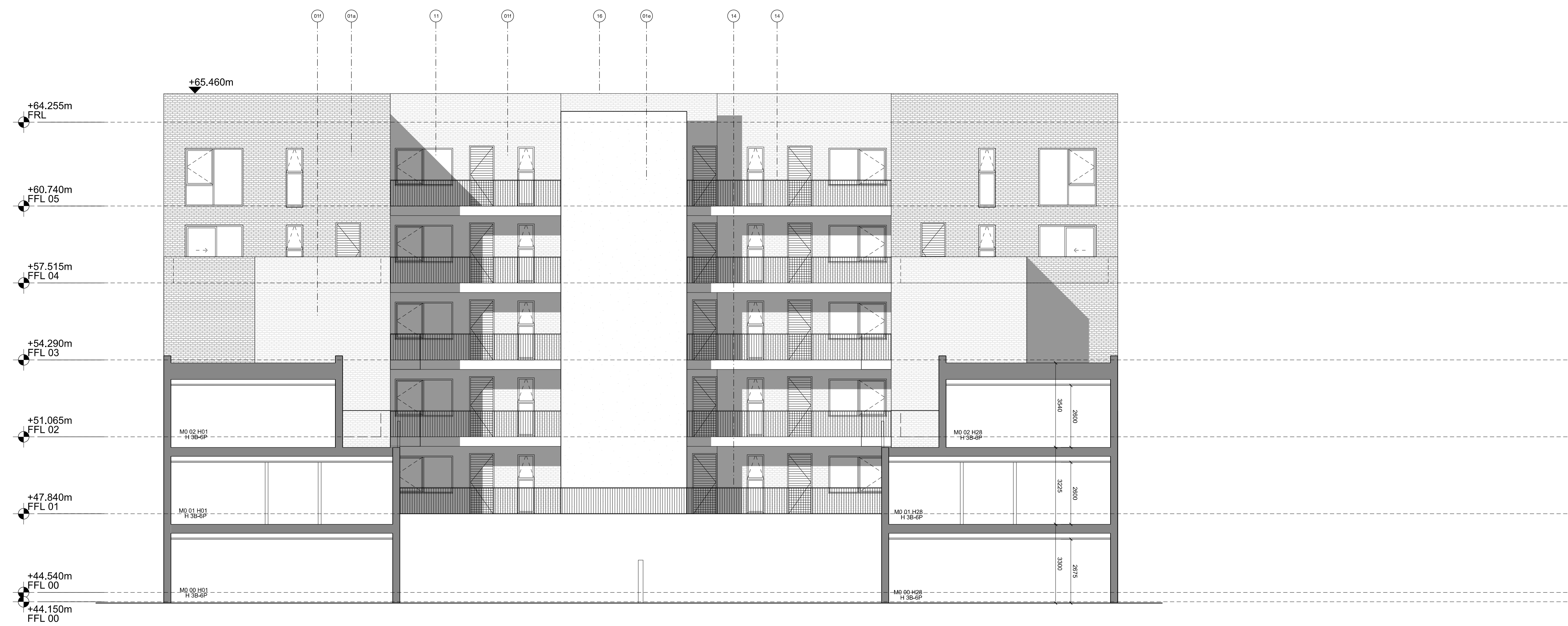
02 Sectional Elevation BB 1:100