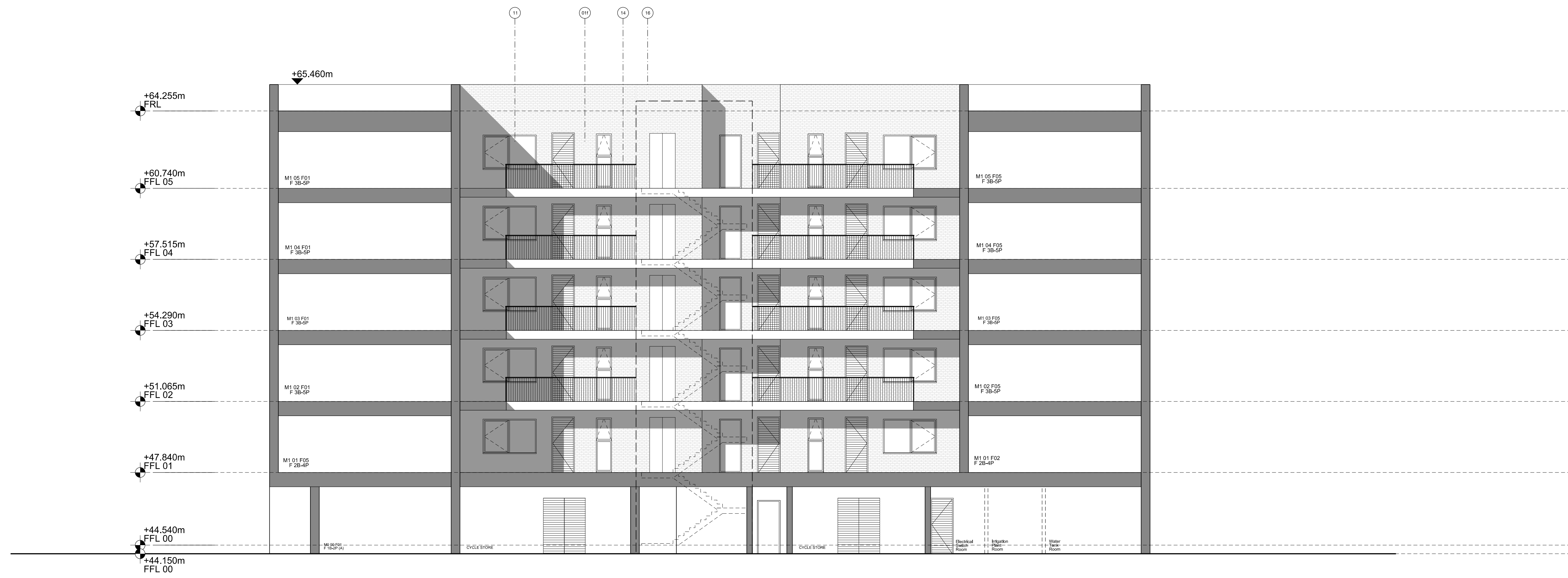
01 Sectional Elevation AA 1:100