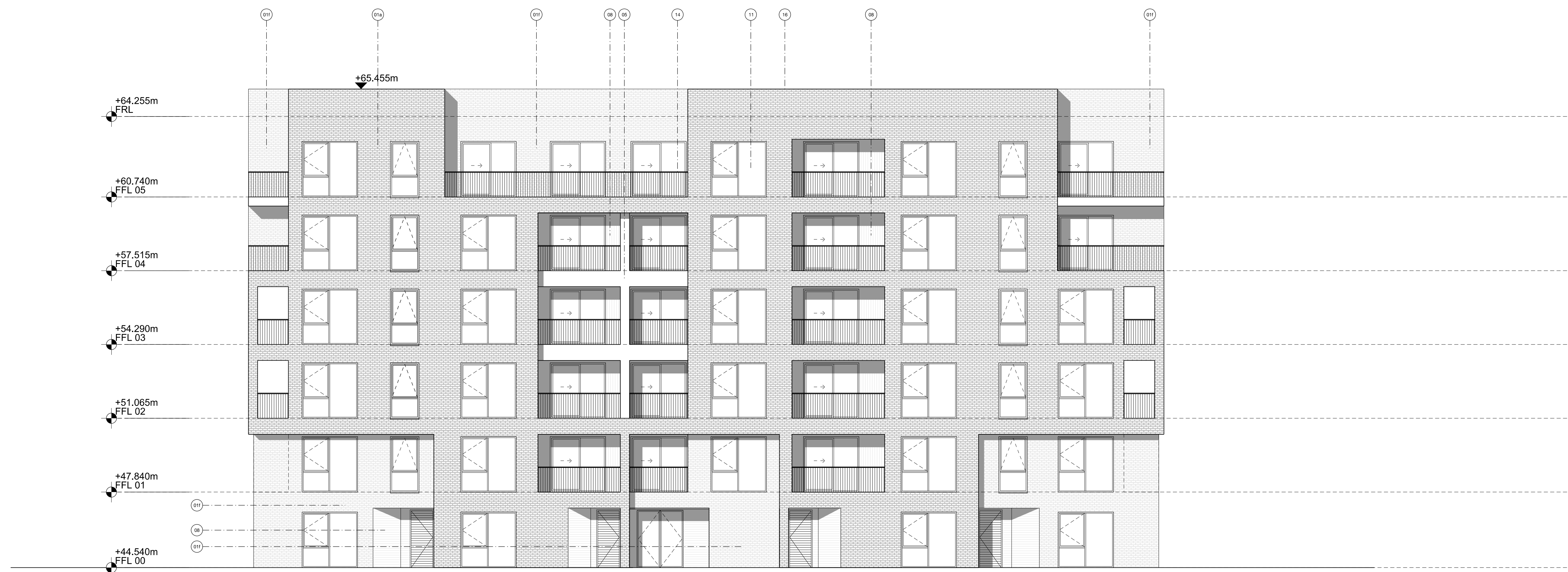
01 North Elevation 01 1:100